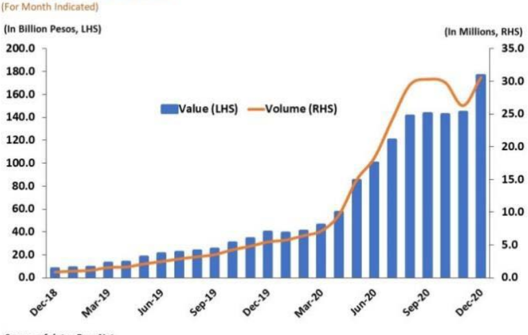
Figure 18 InstaPay Value and Volume