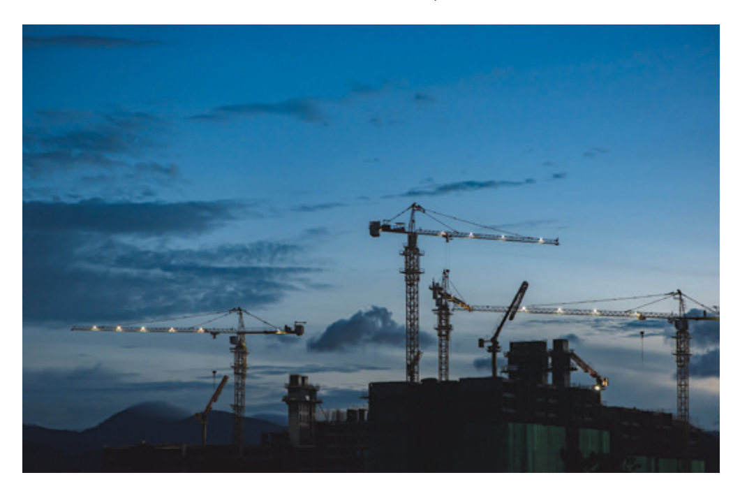
16 Philippine News Agency (2019). DTI pushes proposed EO bringing down shipping costs. Retrieved from https://www.pna.gov.ph/articles/1074997.

In summary, the ECCP proposes the following: (1) the charges of the shipping lines must be transparently clarified and justified; (2) INCOterms must be observed and respected; (3) official clarification on the lead government agency responsible for matters relating to shipping rates and port congestion; and (4) the inclusion of the ECCP Infrastructure and Transportation Committee in the technical working group and other consultations for the aforementioned matter. At any rate, the ECCP stands ready to support the concerned government agencies in this worthwhile endeavor in the name of enhanced trade facilitation, competition and consumer welfare.